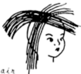
Applying the hair for the wig base

The Cherub hair is glued directly on to the head. First start with uncurled hair (straight) for the crown, glue a strip from one ear across the top of the head and over to the other ear, when dry glue a second strip from the front of the head, to the nape of the neck. Cut all hair that is not directly glued to head off, this is the wig base, you may now glue curls around the head and short curls across the forehead to form a fringe. The hair may be decorated with miniature hand made flowers.