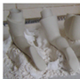
Legs- Support full length with klin prop