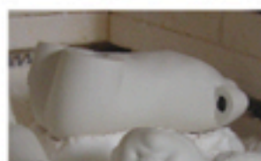
Torso- Lays on its back with klin prop supporting lower back and bottom

Leg and arm mountings must not be removed, this is essential for limbs to stay in position when strung. Cut 2 holes opposite each other where the seam line runs up the leg mounting, these will accomodate the elastic when the doll is strung. Repeat this step for arm mountings.