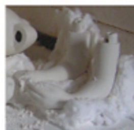
Please Note-follow firing instructions| carefully as failure to do so will result in the doll not fitting together properly.

When using klin prop I coat it with fine silica powder which prevents any marking