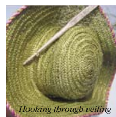
Hooking through veiling