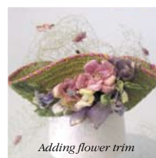
Adding flower trim