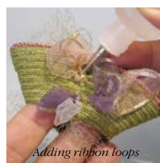
Adding ribbon loops