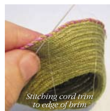
Stitching cord trim to edge of brim